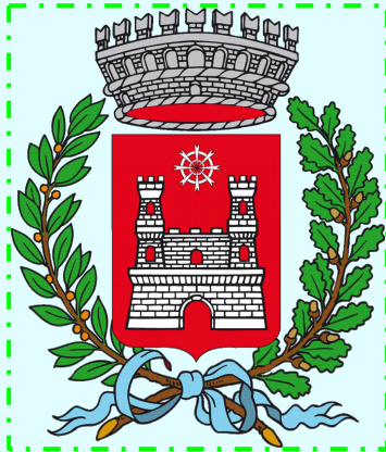
Symbol of the village.

Bagnolo Cremasco is a countryside village in Lombardia, in the north of Italy. It has got about 4,800 inhabitants. Bagnolo is near important cities in this region like Milano, Bergamo, Brescia, Lodi, Cremona, Pavia, etc. From Bagnolo to Crema we take about 5 minutes by car. Crema is a “sweet” city (crema means cream) and it is where kids go to high school. Bagnolo is quite small but it has got a small shopping centre, a sports centre, a library, a chemist's, some baker's, schools, hair salons, bars, a kebab take away shop, a pub and a pizza restaurant and a McDonald's fast food restaurant. It has got a main church and some small churches. There are also factories where people from Bagnolo work.